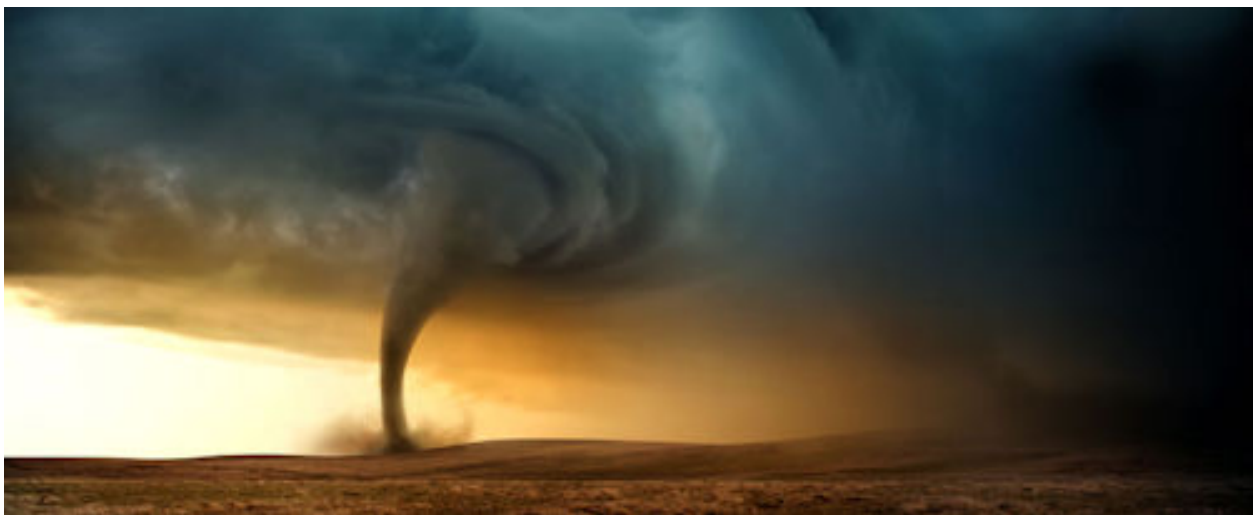
Figure 2: This is a tornado